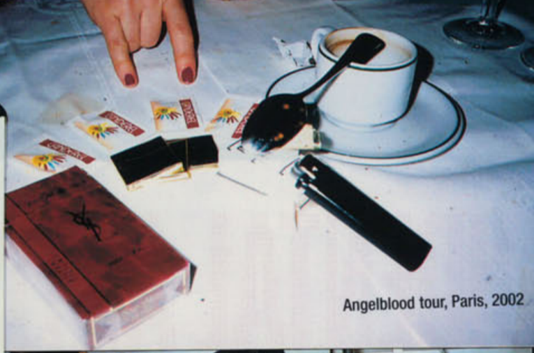
Angelblood tour, Paris, 2002