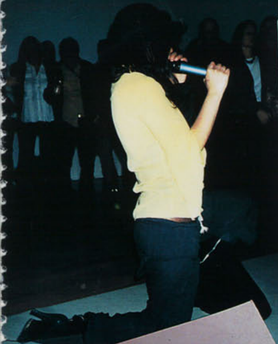
Angelblood performance, "Anti-Pure" opening, Germany, 2003