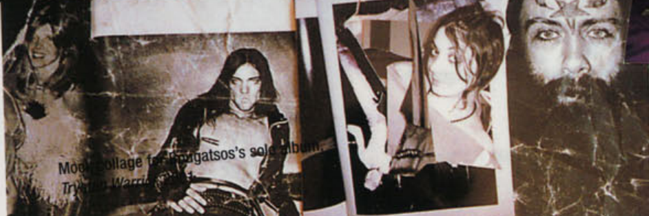
Mod collage for Bougatsos's solo album, Try to Remember