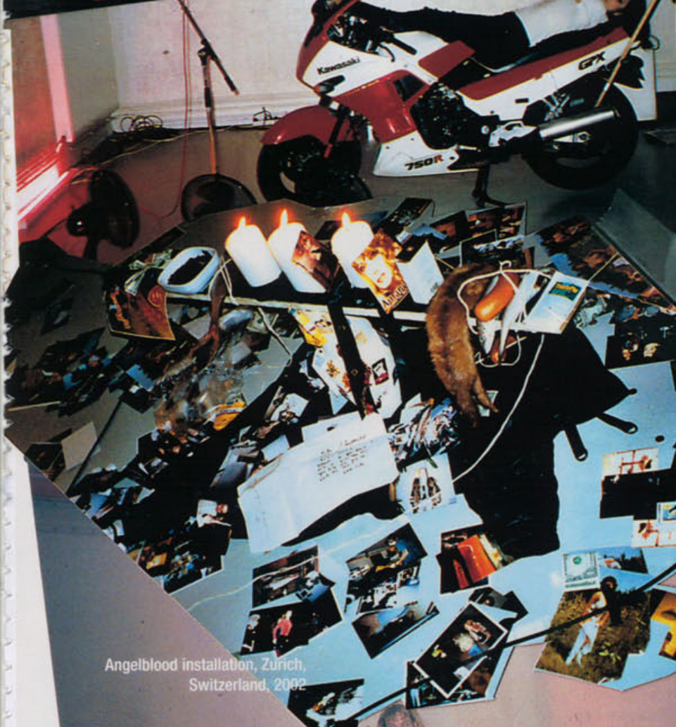
Angelblood installation, Zurich, Switzerland, 2002