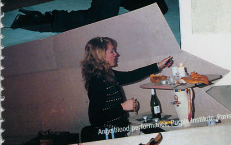
Angelblood performance, Purple Institute, Paris, 2002