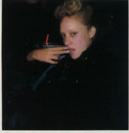
Chloë Sevigny, leaving Italian Vogue shoot, 2003