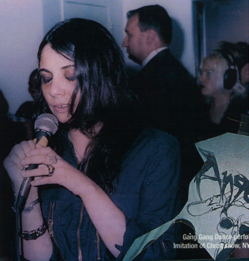
Gang Gang Dance performance, Imitation of Christ show, NY