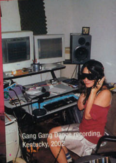
Gang Gang Dance recording, Kentucky, 2002