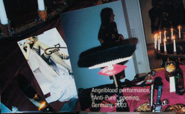
Angelblood performance, "Anti-Pure" opening, Germany, 2003