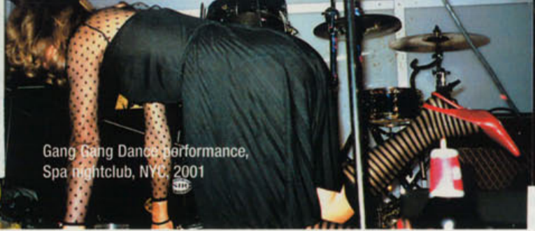
Gang Gang Dance performance, Spa nightclub, NYC, 2001