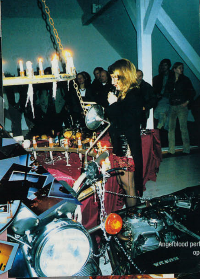
Angelblood performance, "Anti-Pure" opening, Germany, 2003