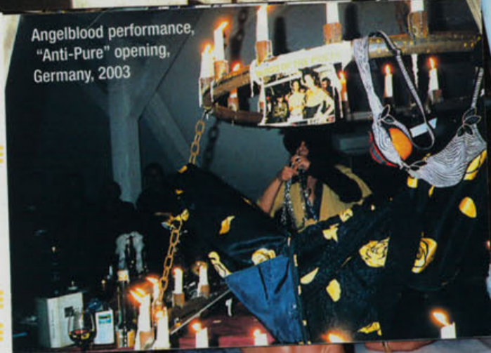
Angelblood performance, "Anti-Pure" opening, Germany, 2003