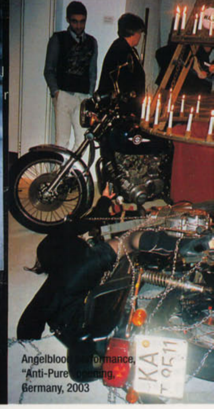
Angelblood performance, "Anti-Pure" opening, Germany, 2003