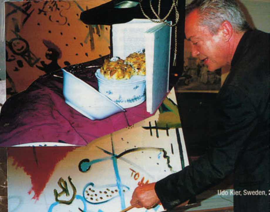
Udo Kier, Sweden, 2