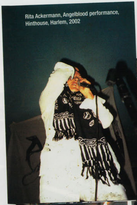
Rita Ackermann, Angelblood performance, Hinthouse, Harlem, 2002